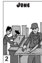
2 (at work)