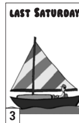
3 (on a boat)