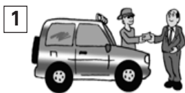
buy a jeep